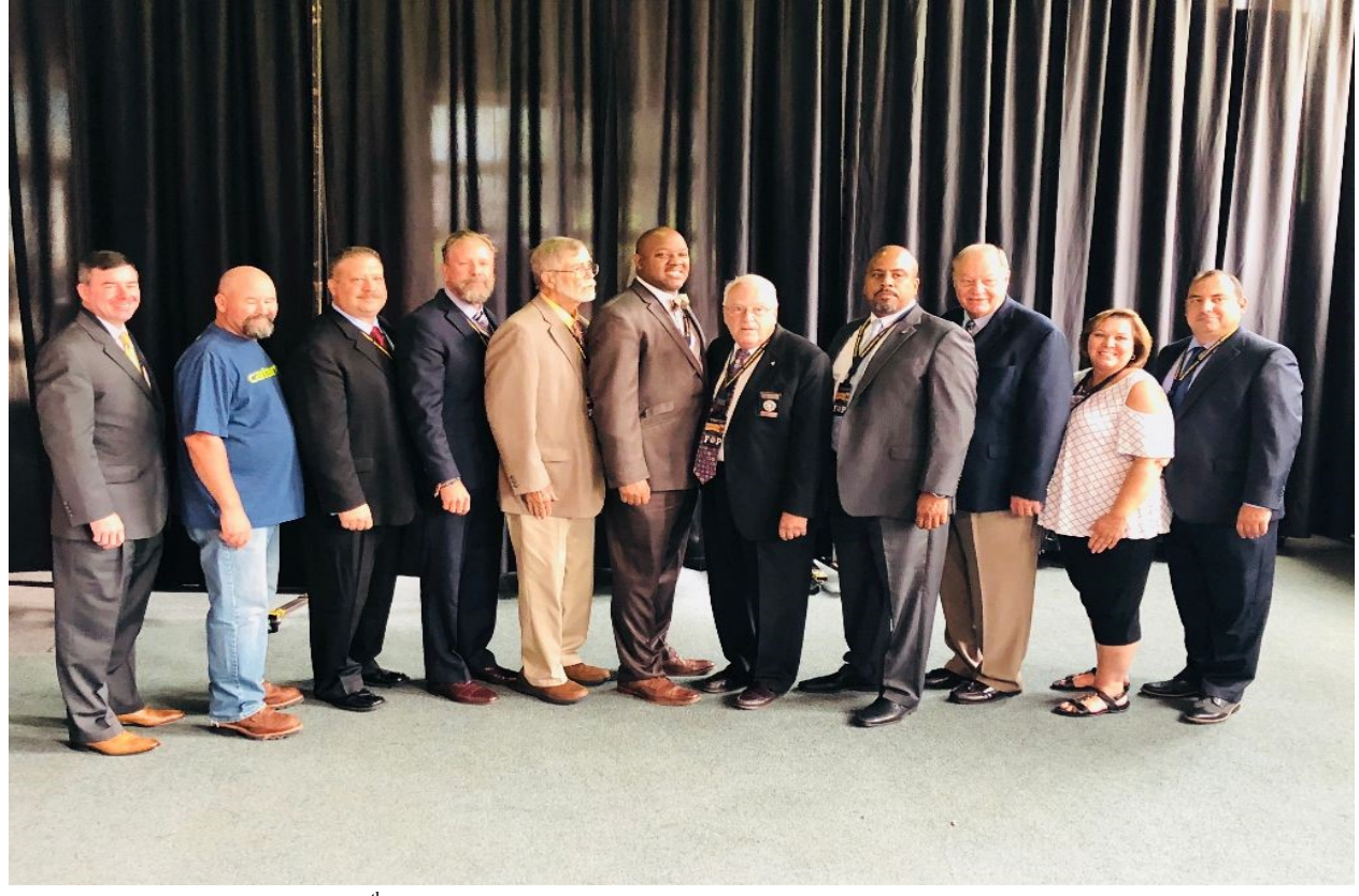
On August 22, 2018 at the 26<sup>th</sup> Maryland State Fraternal Order of Police Biennial Conference the members listed below were either re-elected or elected to represent you and your interest as members of the State Executive Board.