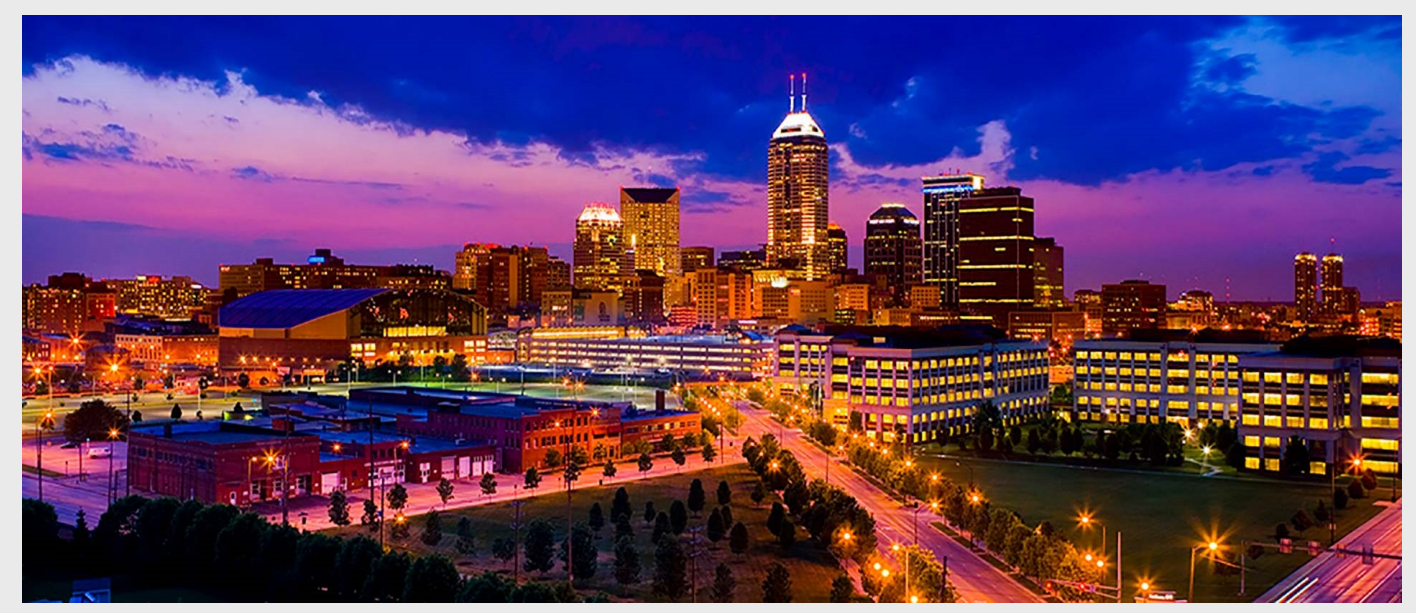
August 16-19, 2021 Indianapolis, Indiana