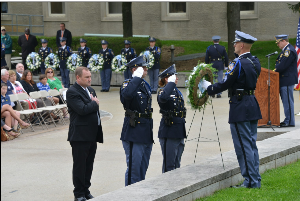
Laying of the FOP Lodge 4 wreath at the Baltimore County Memorial Service

the Political Action Committee, Executive Board of Directors and General Membership.