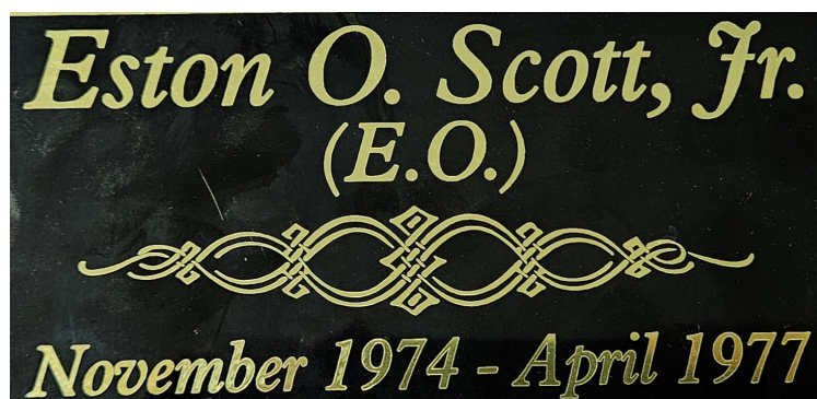
The commemorative plate that hangs beneath Scotty's portrait at the Lodge.